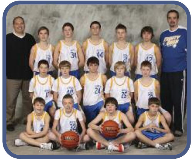
Boys Varsity Team