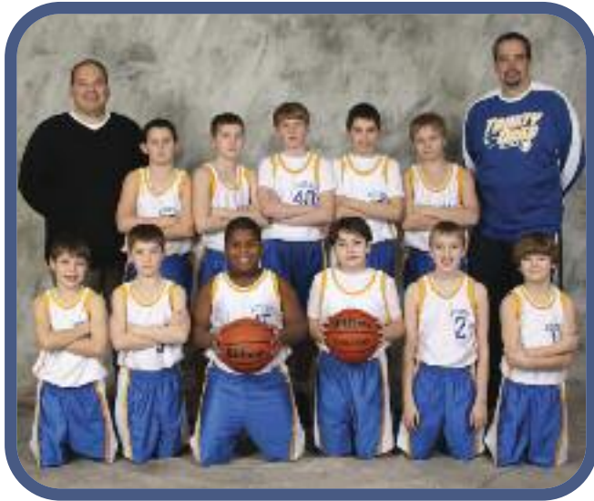
Boys Junior Varsity Team