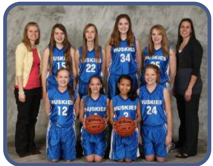
Girls Varsity Team